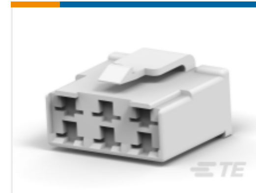
TE Part # 178023-1 FF 250 PLUG HSG 6P DBL LOCK NATURAL