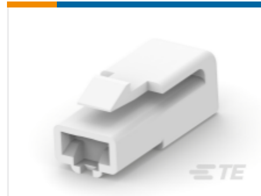
TE Part # 176987-1 FF 250 PLUG HSG 1P NYLON NAT