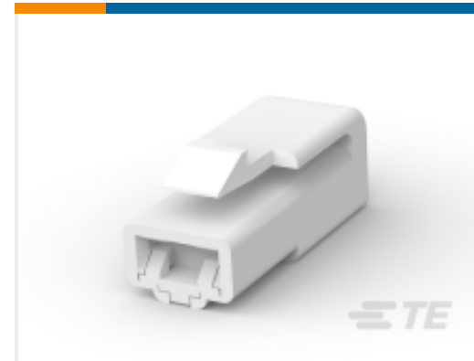
TE Part # 176986-1 FF 250 PLUG HSG 1P NYLON NAT