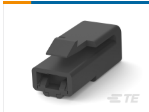
TE Part # 176986-2 FF 250 PLUG HSG 1P NYLON BLACK