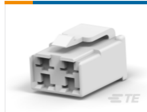
TE Part # 178005-1 FF 250 PLUG HSG 4P NYLON NAT